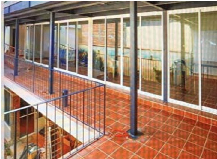
The Oaxaca Learning Center

The Oaxaca Learning Center (TOLC) continues to thrive in its goal to provide underserved Oaxacan youth ages 14 to 24 with the skills, tools, and self-confidence to envision a new future and move beyond the limitations of poverty. In a holistic learning community, the students are provided with academic tutoring in math, physics, chemistry, and English, with personal support provided by the staff and tutors, many of whom have grown through the benefits of TOLC. The Mexican Government has identified it as one of the best youth programs in Mexico. Since its founding in 2005, TOLC has served 3831 students and provided 81,644 tutoring hours. Academic success on entrance exams is 83%, far above the 37% Oaxaca state average.