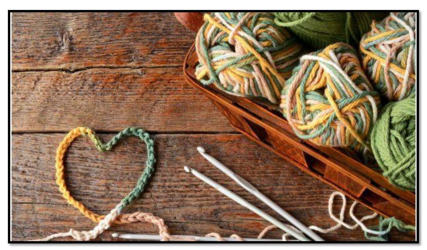
Today's worship service includes recognition and celebration of the 20<sup>th</sup> anniversary of the ministry and outreach of St. John's Praying Hands Stitchers!