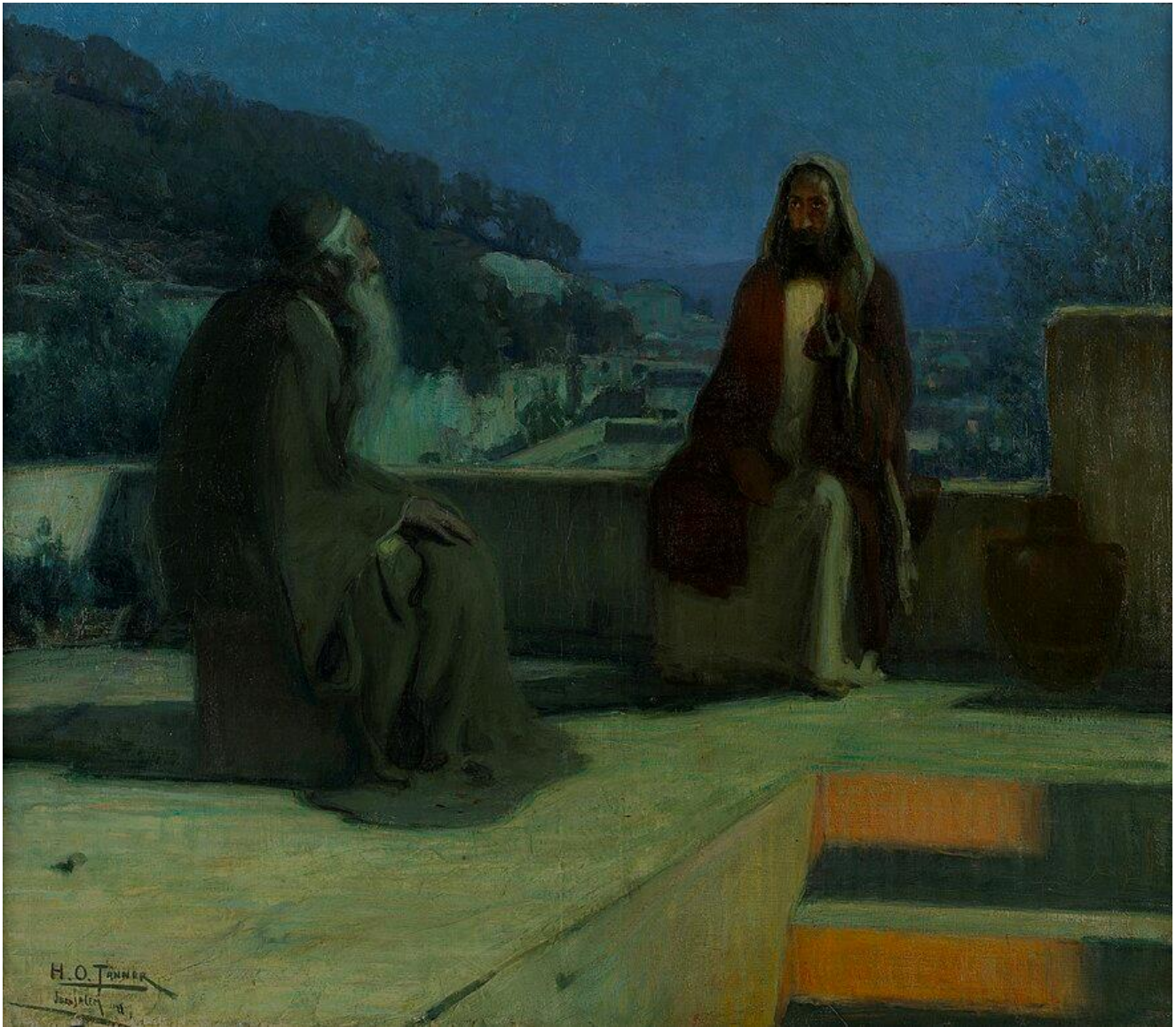
Nicodemus Visiting Jesus , by Henry Ossawa Tanner